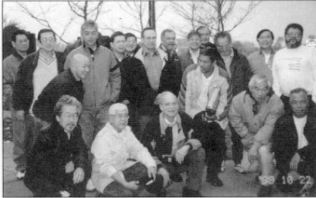
One of the many pit stops on the way to Boston