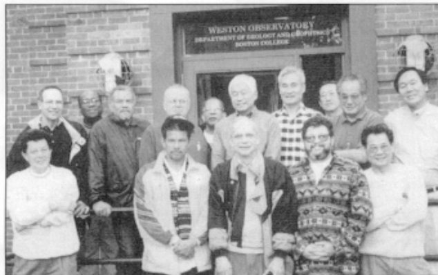
Egg heads who made it to the Weston Observatory, Department of Geology & Geophysics