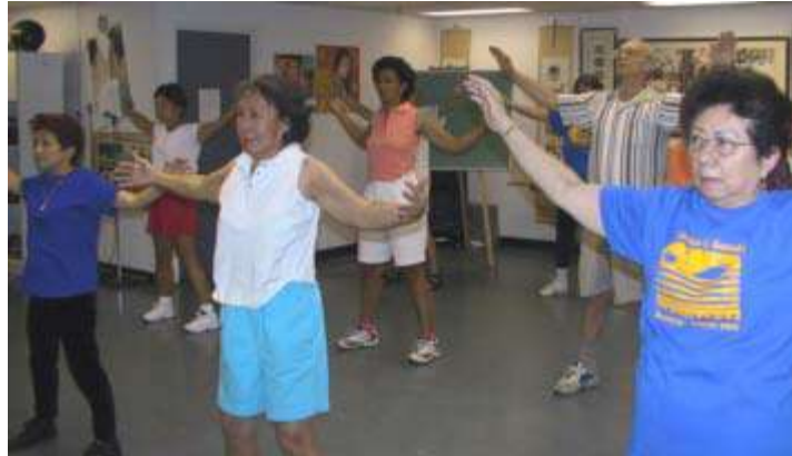
Tai Chi class