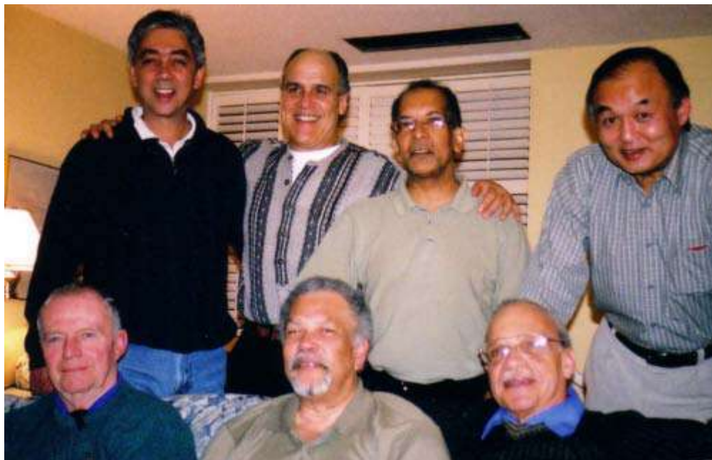
Get-together at Dalhouses.