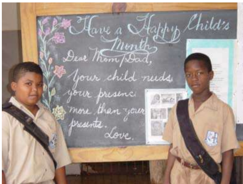
Child's Month 2002 at St.G.C. A message to parents everywhere

$10,000 quality newsletter appreciated by many for a mere $4,400 all because of donated time by dedicated supporters. You can see why we are appealing to you for your contribution to the cause. We have enclosed a REMINDER with the newsletter for those of you who may have forgotten to send in your dues. As well, the reminder is also designed to allow for updates to addresses, telephone numbers and email addresses.