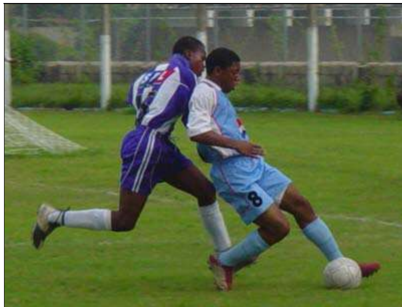
St. G. C. player tackled from behind

Hurricane Season brought a few strong storms close to Jamaica, and the school was hit hard by tropical storms Lily and Isadore, which brought heavy rain and strong winds to Kingston. Both storms strengthened and eventually hit our northern neighbors even harder. The school was littered with fallen branches and one large tree. When water damage caused the ceilings of several classrooms to fall, several Second Form classes had to be moved into the auditorium until they were fixed.