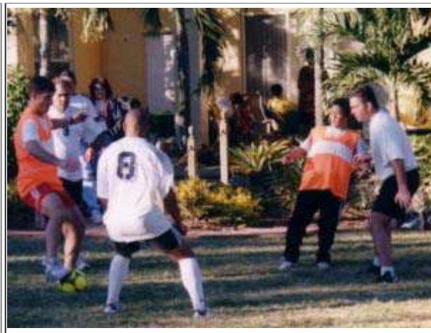
Keeping the ball in the air..... oops!

After the games, we enjoyed a knight's feast consisting of chicken soup, jerk pork, chicken and stew peas, and this being the festive season, we finished it off with Jamaican Christmas cake.