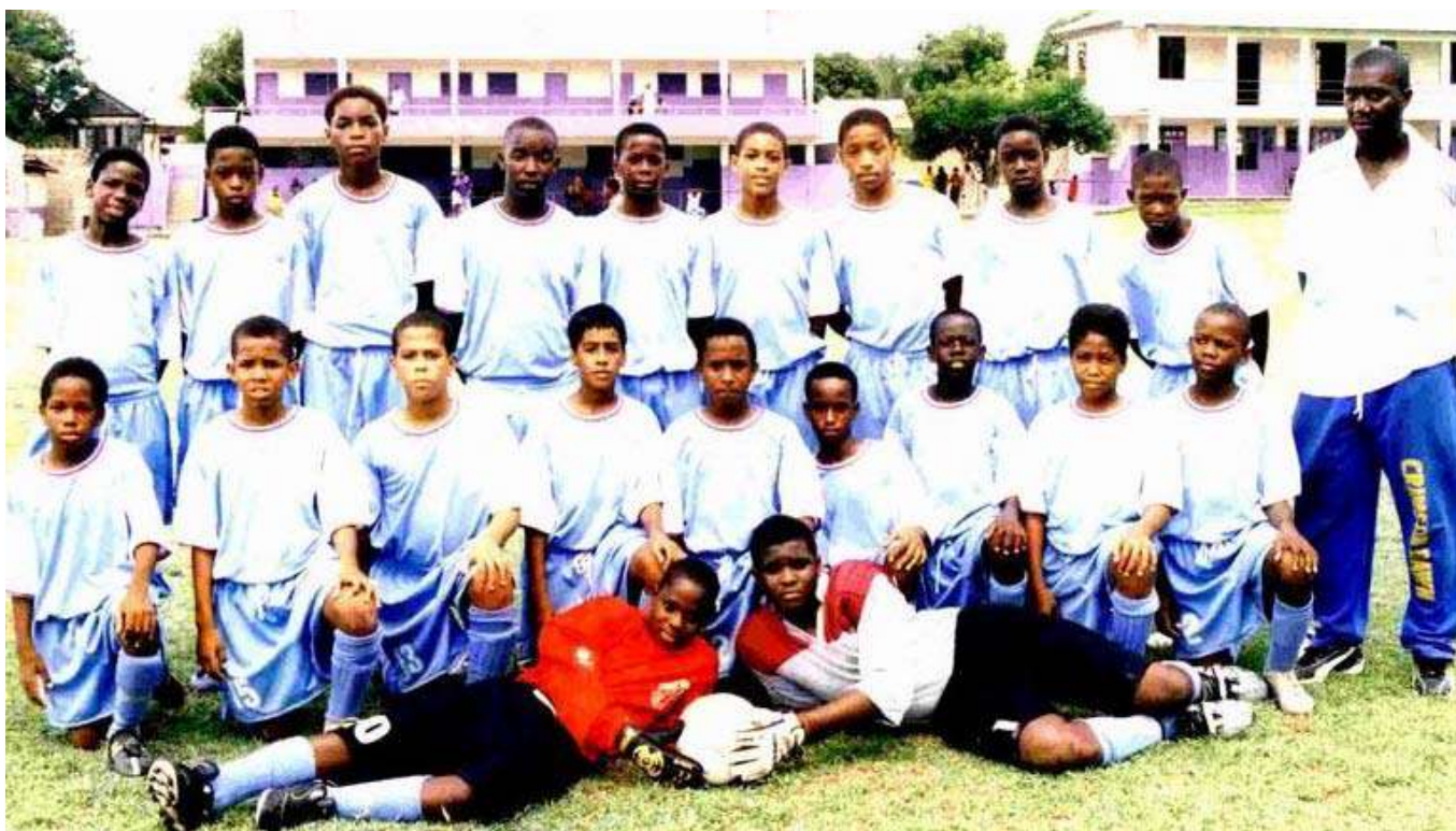
The under-14 Pepsi football team

As always, new teachers and staff brought new energy, balanced by the wisdom of the elder faculty. A new Dean of Students, newly arrived Jesuit Volunteers, and many new faculty/staff brought some fresh faces and new ideas. Improving academics was the primary focus and the curriculum continued on track.