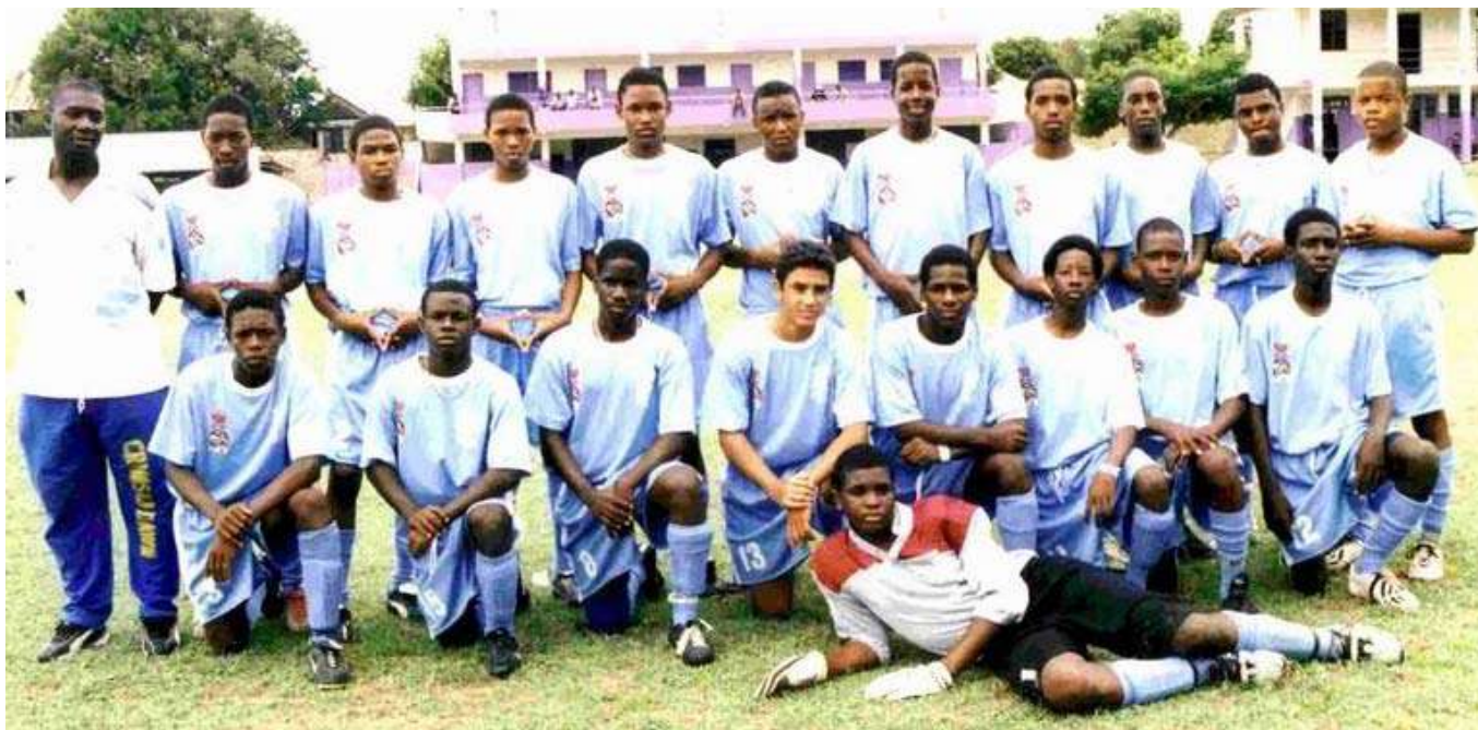
The StGC Colts Football team

As exams neared in November, students were absorbed by the excitement of the playing of our younger football teams. The two youngest teams - the Under-14 Pepsi football team and the Under-16 Colts football team were found both battling for the championship, and crowds filled each game. A disappointing first round loss had left the Manning Cup football team watching from the sidelines, but both younger football teams - the Pepsi and Colts - fought hard and were each successful. Never once failing, the younger StGC Pepsi football team finished their complete season unbeaten, by beating Norman Manley in late November to claim the Under- 14 Football Championship.