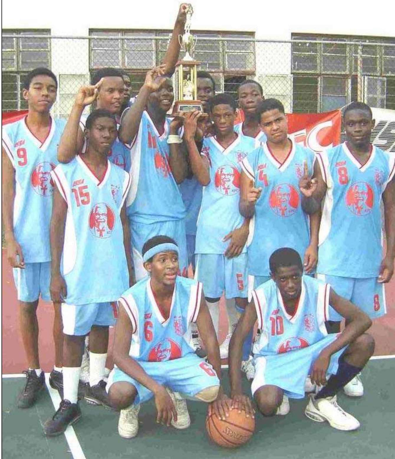
Champion Basketball Team