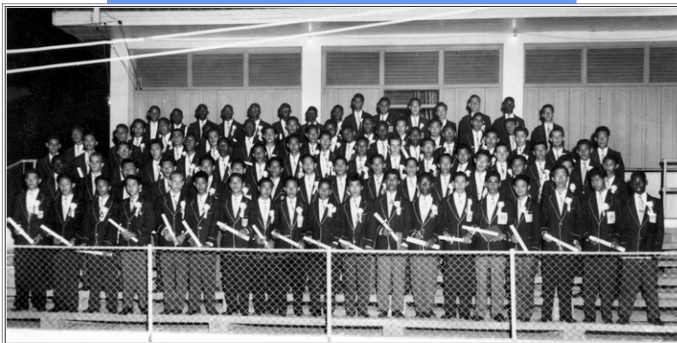
Class of 1957- Where are you in this?-see you at the reunion