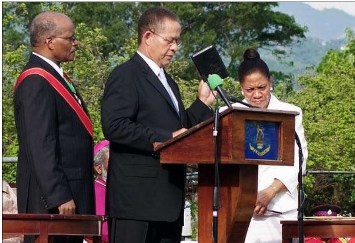
Georgian Hon. Bruce Golding is sworn in as Prime Minister of Jamaica