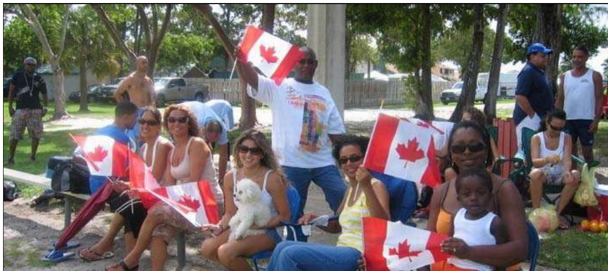
Ontario wives and supporters holding high the Canadian flag in Florida