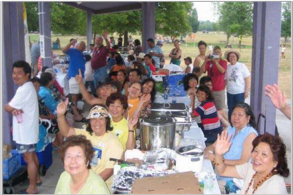
JoJo's pepperpot soup