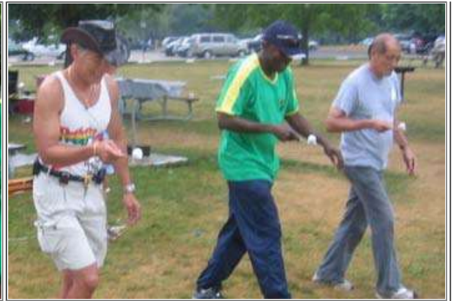
See the concentration in the Egg & Spoon race