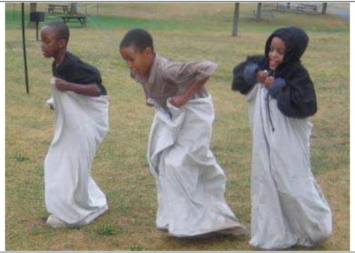
Junior sack race