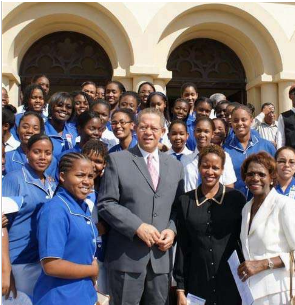
Georgian Prime Minister Hon Bruce Golding & Family with ICJS Alumnae at 150th Anniversary celebratory Mass at the Cathedral on Jan13, 2008