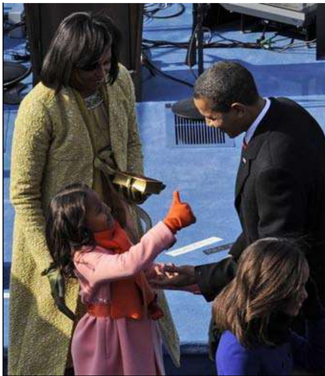
"Great job, Dad"

himself is that he is not seen as coming from the old white guard that has run the USA for decades, but rather, he is viewed as being a sensible, intelligent human being, one who brings to the oval office, profound ethics and values like no other president before him. It is these qualities that have given his people and the rest of the world's leaders great hope, hope that he may use his influence