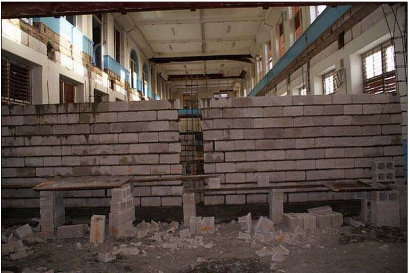
Latest photo update-Termite free O'Hare –restoration in full swing

Law of Close Encounters - The probability of meeting someone you know increases dramatically when you are with someone you don't want to be seen with.