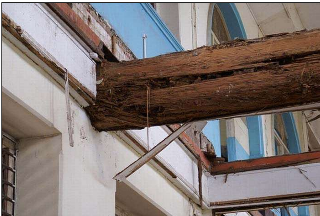
Termite riddled O'Hare May 2009

Law of Biomechanics The severity of the itch is inversely proportional to the reach.