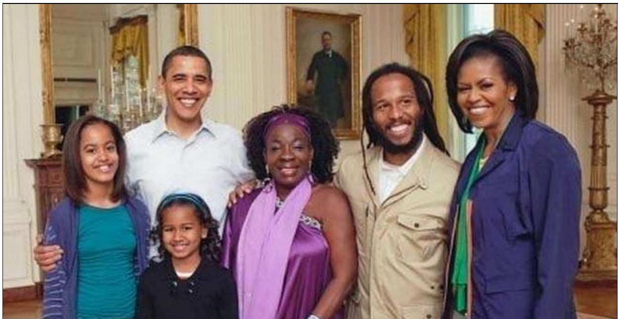
Ziggy Marley at the White House with the American First family