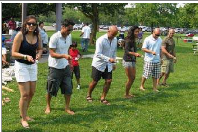
Young people Egg & Spoon