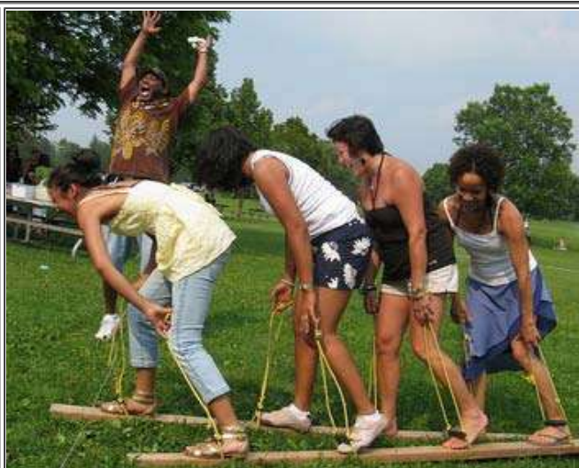
Horray !-ICHS Finishes race