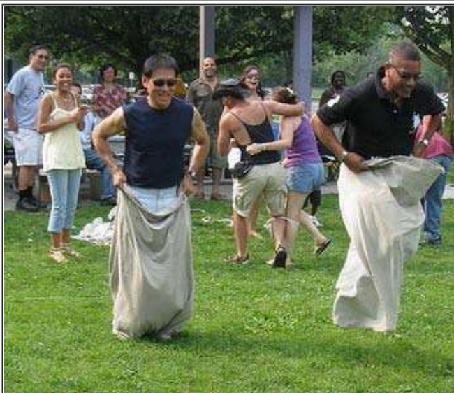
Adult Sack race