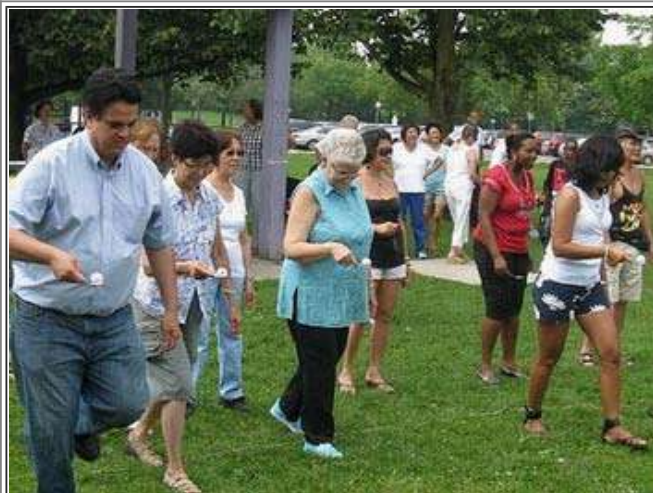
Adult egg & spoon race