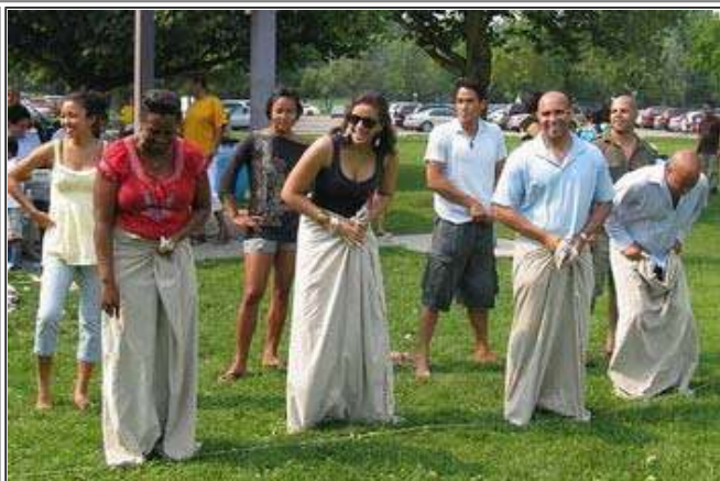
Young people Sack race