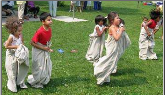
Kids Sack race