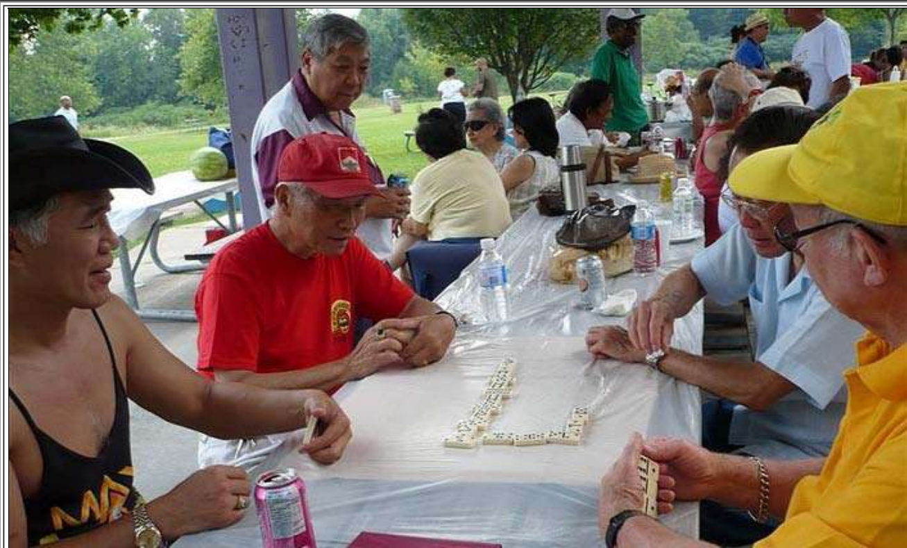
"Stop holding up the game and play"