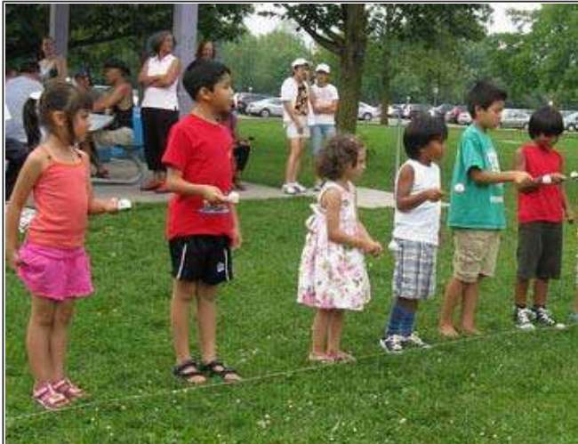
Kids Egg & Spoon race