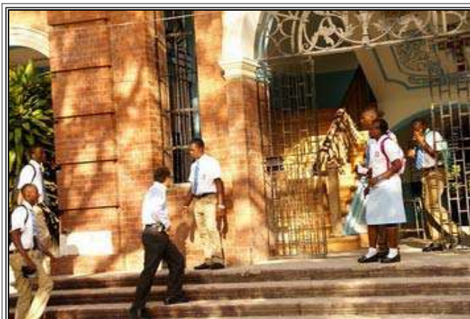
Happy students entering refurbished O'Hare