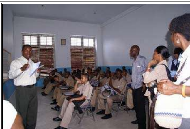
Students, parents, with teacher in new classroom O'Hare on opening day